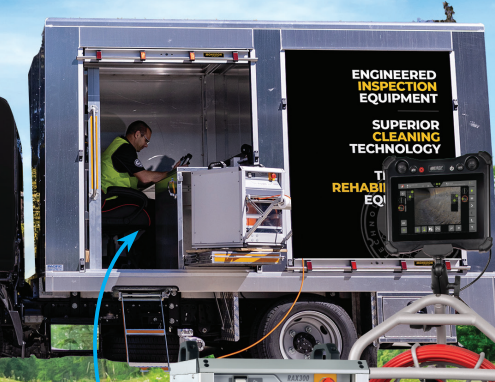
Operator on site Wincan VX desktop/laptop