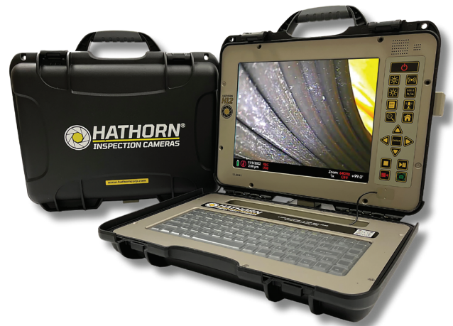
*Uses a 18V Milwaukee battery (not included)