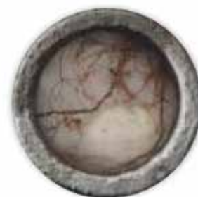
Step 2 - Add RootX. Foam kills remaining roots and inhibits future regrowth.