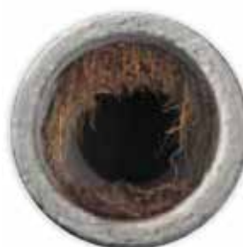
Step 1 - Mechanical cutting of roots clears roots from pipe, leaving some behind.