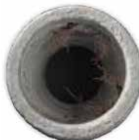
With RootX, debris is decaying and roots are stunted.