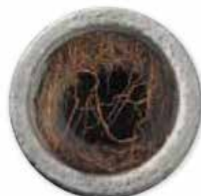
Without RootX, roots begin vigorous regrowth into the newly cleared space.