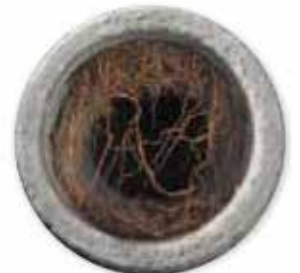
Without RootX, roots begin vigorous regrowth into the newly cleared space.