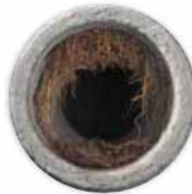
Step 1 - Mechanical cutting of roots clears roots from pipe, leaving some behind.