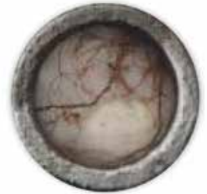
Step 2 - Add RootX. Foam kills remaining roots and inhibits future regrowth.