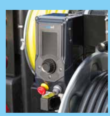
eControl<sup>+</sup> control panel (with RioMote remote control)