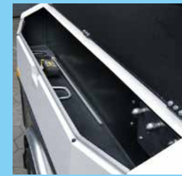
Large storage compartments