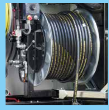
90° + 180° Pivoting hose reel